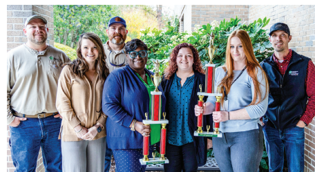
Employees from Berkeley Electric and Berkeley Propane proudly display their trophies for winning "Most Christmas Spirit" and "Most Creative" float in the Moncks Corner Christmas parade.

The past several months have been a whirlwind of other community events as well, starting with several Halloween and fall festivals, the re-dedication of the Maude Callen Clinic in Pineville and making a delivery to the Fisher House in Charleston, which serves our veterans. We even took part in four Christmas parades and managed to bring home trophies for the "Most Christmas Spirit" and "Most Creative" float. And before I forget, we even managed to squeeze in not one, not two, but four days of Annual Meeting drive-thrus with over 12,000 of our members.